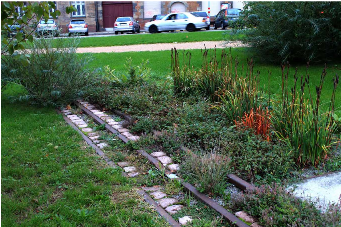
Figure 13 | Details of planting and the recycled train tracks from the site.