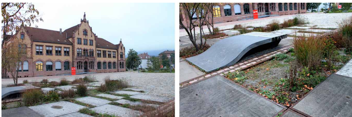
Figure 11 | Local planting and view to the old train station of Freiburg. The details of the train tracks and the memory of the area is brought back in a system showing applicability of circular city material recycling applications (left), and details of seating designed as being peeled-off the ground to allow for maximizing the space for permeable green surfaces that are entry points to the infiltration system to the underground storage, but also to the groundwater reservoir (right).

Zollhallen Plaza is located at the entrance to a historic train station designated for customs that was restored in 2009 (Figures 11–14). Although the scale of the plaza is small, and it was initially designated to be a simple hardscape area for the new users of this public building, the design team set an ambitious target: to disconnect the plaza from the sewer system, and to create a small-scale urban plaza that would be an example of water-sensitive urban design (WSUD). A series of infiltration points located in the plaza through planters, connected with subsurface gravel trenches and in-built filter medium, are used to reduce the hydraulic overload on the sewer system. The plaza is designed