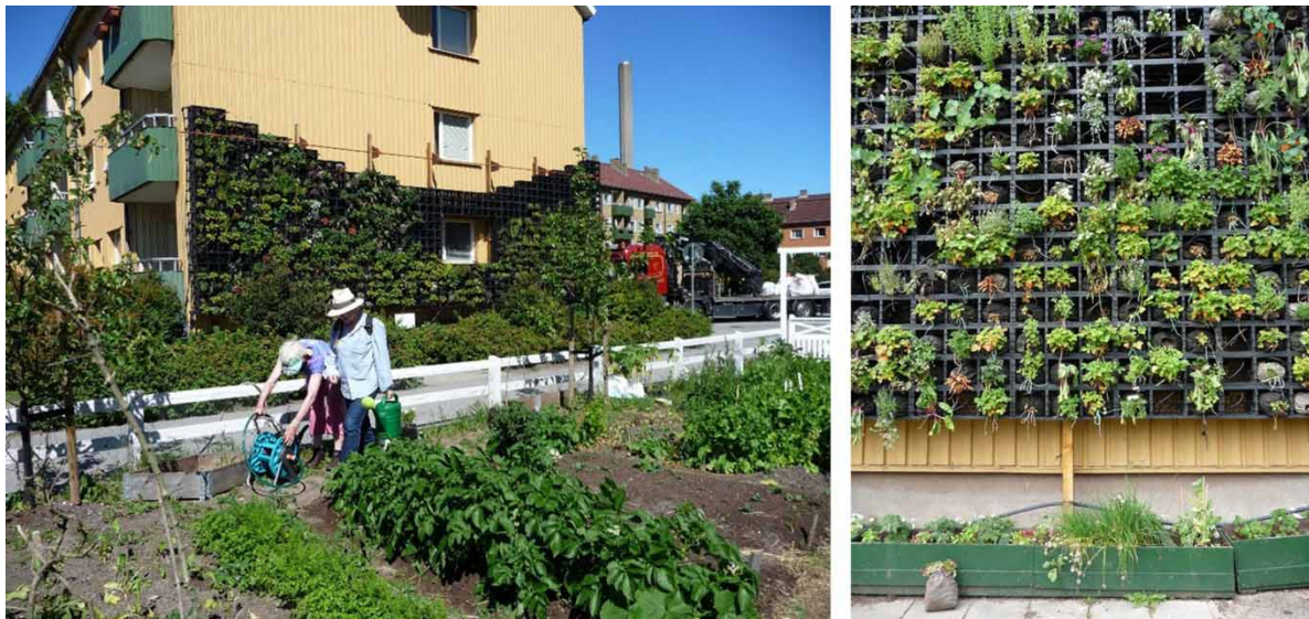
Figure 7 | Seved Edible garden (left); and Seved Edible green wall (right).

The Seved Edible green wall in Malmö, Sweden was created in 2013 as a pilot project for the demonstration of vertical community gardens (Figure 7). The main idea was to inspire property owners to use the city space in a new way, as in many areas a lack of space does not allow residents to create community gardens or to grow plants in containers. The wall structure, which has a total area of 50 m 2 and a maximum height of 5 m, accommodates edible plants throughout the whole year – with specific plant types replaced depending on the season. The ‘summer wall,’ which includes plants such as strawberries, chard, lettuce, celery, spinach and herbs (oregano, lavender or rosemary), is cultivated from May until November. In November the ‘summer wall’ is replaced by the ‘winter wall,’ which is represented mostly by green cabbages and herbs like oregano and thyme. The selection is mainly determined by the visual aesthetics of the plants, with a preference for those that are bushy and compact – while plants that are especially sensitive to wind are generally avoided.