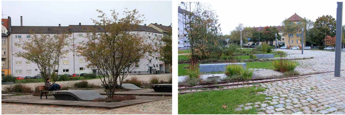
Figure 14 | View of the seating as used by visitors and locals. Area to relax and contemplate urban nature (left); and seating in the green zone and looking out to the city (right). The plaza stormwater system is disconnected from the municipality sewer.

to hold on its surface the volume of water generated by a 20-year, a 50-year and a 100-year rain-event, and to provide flood safety to the city while recharging the ground water table.