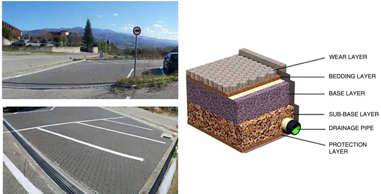
Figure 9 | The permeable pavement experimental site at University of Calabria.

pavement, and the other left impermeable for use as a reference. It has an average slope of 2%, and a total profile depth of 0.98 m. The surface wear layer consists of porous concrete blocks characterized by high permeability (8 cm depth); while the base layer (35 cm depth); sub-base layer (45 cm depth) and bedding layer (5 cm depth) were defined by following the suggestions of the Interlocking Concrete Pavement Institute (ICPI), which recommends certain ASTM stone gradations. In order to evaluate the hydraulic behaviour of the permeable pavement, a reservoir element model was developed in Turco et al. (2018) . In this study, the model was calibrated and validated against measured runoff collected on the specific experimental site described here.