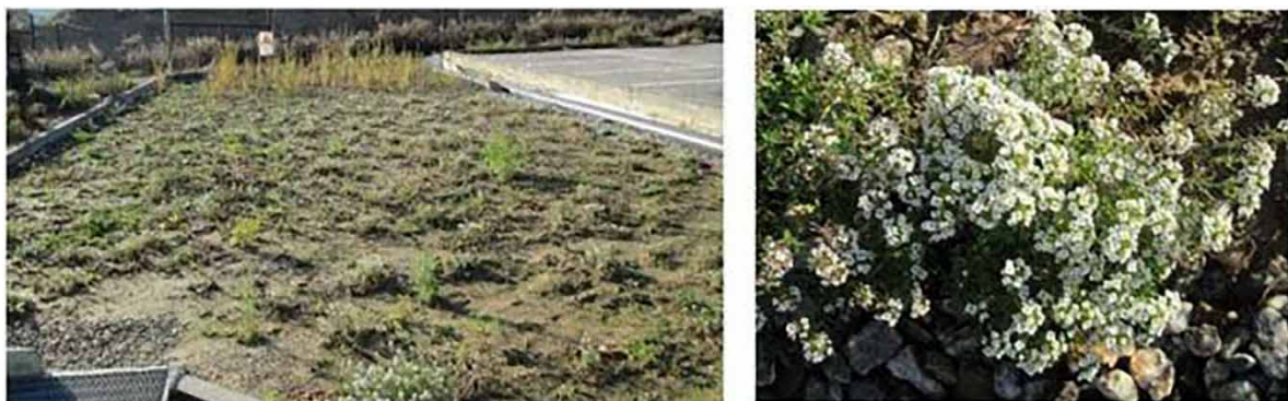
Figure 10 | The stormwater filter experimental site at University of Calabria.

Finally, the stormwater filter experimental site ( Figure 10 ), installed downstream from the permeable pavement, is used to treat stormwater runoff discharged from the adjoining impervious parking lot. It has a surface area of around 125 m 2 , an average slope of 2%, and a total profile depth of 0.75 m, and is covered by a soil substrate vegetated with Mediterranean species. A high permeability geotextile is placed between the soil substrate and the filter layer to prevent fine particles from migrating into the underlying layer. The filter layer is composed of highly permeable gravelly material. Finally, an impervious membrane at the bottom of the profile prevents water percolation into deeper horizons. Based on data collected at the experimental site ( Brunetti et al. 2017 ), the