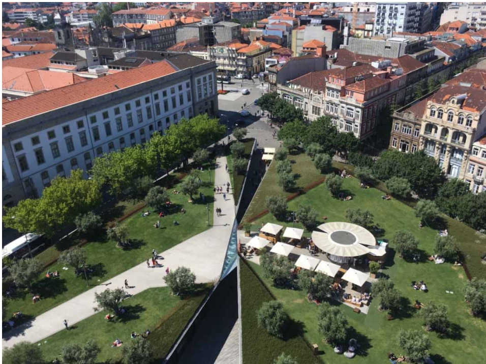
Figure 3 | Example of cities sharing space with vegetation: Green roof at Praça de Lisboa, Porto, Portugal.

Recently, there is an increasing interest in developing more cost-effective green roof design, to use alternative building materials for liners and substrates, to combine greened roofs with solar energy production, and to create multi-purpose recreational space (Figure 3). Several cities are following this trend, and the EU Research and Innovation policy agenda promotes re-naturing cities and territorial resilience for socially and environmentally responsible communities, through the integration of NBS (EU 2015). However, a city's vision for the promotion and use of green roofs varies with the particularities of each place. Given the sustainability of green roofs over their full life cycle, policies are needed that encourage their use through regulation or financial incentives (such as water or property fee reduction), conditional to a pre-defined sustainable development goal attainment. Setting up quality standards for green roofs is important to scale up this NBS, with the German and the Spanish green roof guidelines being good examples for such (NTJ 11C 2012; FLL 2018).