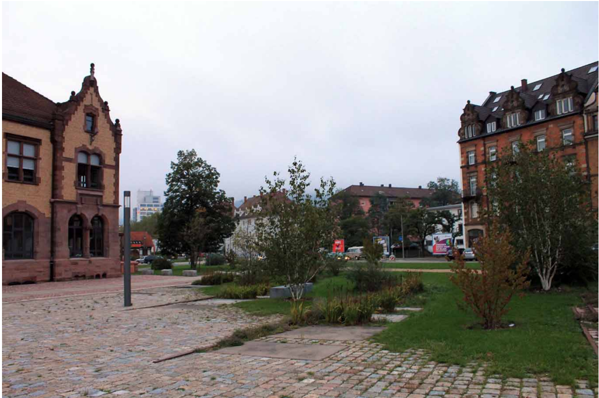
Figure 12 | Connecting the hardscape to the green zones, extending the ecology and urban nature qualities of the site.