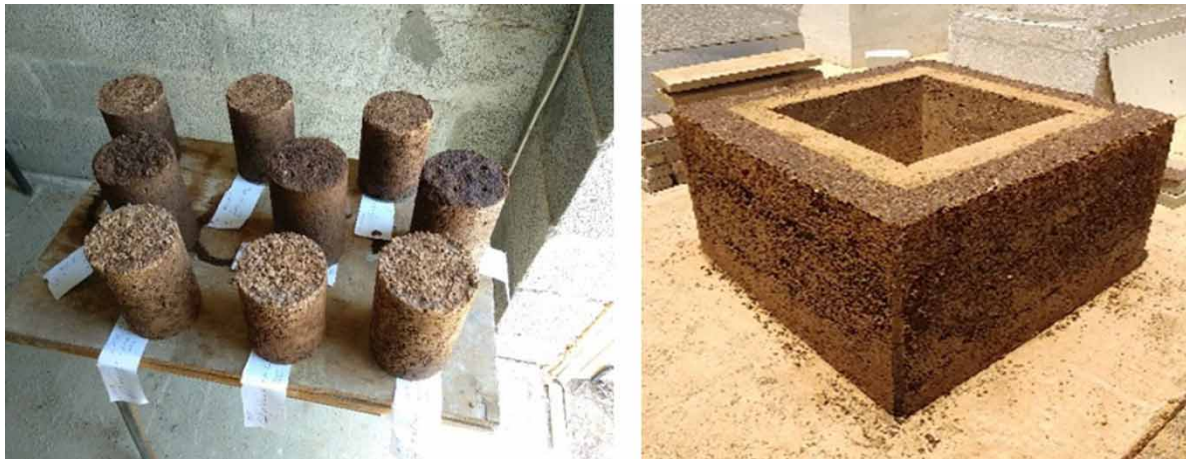
Figure 6 | (left) OP biocomposite samples with varying OP particle size, water content, and binder ratio; (right) test cell walls, with respective 10 cm-thick layers of external orange peel (OP) biocomposite insulation and internal rammed earth (RE) mass, before plastering and roof installation.

In the initial phase of the study, samples of the OP bio-composite with different proportions of OP and clay binder were compared in order to identify the highest proportion of insulating OP that could be used without compromising the mechanical stability of the composite as an infill (non-load bearing) material (Figure 6). The optimal configuration (with a density of 900 kg/m 3 ) was found to contain 46% OP and 52% clay by weight, with the small remainder consisting of Natural Hydraulic Lime (NHL) to minimize shrinkage. This proportion of insulating plant material is in agreement with general recommendations for hemp-lime mixtures as well. OP particle size fractions (from <1.2 to >4.7 mm) and water content were also optimized.