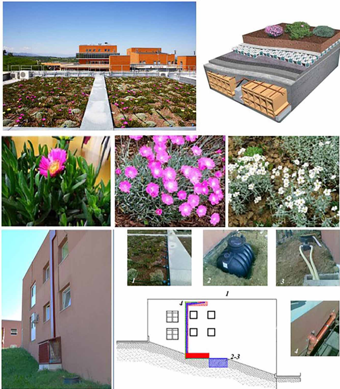
Figure 8 | The green roof experimental site at University of Calabria.

As documented in Palermo et al. (2019), the green roof described here demonstrated good hydraulic performance in terms of stormwater retention in a Mediterranean climate. By analysing the monitored data collected between October 2015 and September 2016 (62 rainfall events) at an event scale for one of the vegetated sectors, the mean value of subsurface runoff was found to be 32.0% – while the subsurface runoff coefficient, obtained considering stormwater events with precipitation depth of more than 8.0 mm (35 rainfall events), was 50.4%. In addition, the integration of the green roof and rainwater harvesting system implemented in the experimental site provided considerable benefits in terms of rational management of water resources. In this vein, a possible smart optimization of the green roof and rainwater harvesting system was described in Piro et al. (2019b).