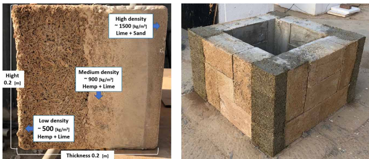
Figure 4 | (left) Gradient HL cross section; and (right) gradient HL test cell before plastering and roof installation, with homogenous hemp-lime cast on the corners to prevent thermal bridges.

In the first phase of the study, a life-cycle assessment of a homogenous HL biocomposite ( 450 \text{ kg m}^{-3} ) showed that the net carbon emissions of HL production are drastically reduced relative to a conventional building material with similar density and thermal properties, and that the magnitude of this reduction in embodied carbon is equivalent to about five years' worth of carbon emitted due to seasonal heating and cooling of a typical building (Florentin et al. 2017). The HL was also compared to a material combining internal thermal mass and external thermal insulation, which was better able to moderate the temperature fluctuations of a desert climate. However, because this variable density insulated concrete is based on cement and expanded polystyrene, it is very high in embodied energy and carbon. Thus the second phase of the study focused on the development and analysis of a variable density 'Gradient Hemp-Lime' block (Figure 4) which could significantly reduce operational as well as embodied energy and carbon emissions.