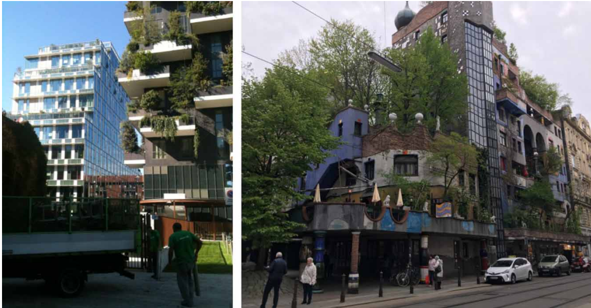
Figure 2 | Examples of building integrated trees. Left: gardeners in front of Bosco Verticale in Milano, Italy and right: the Hundertwasser Haus in Vienna, Austria (photos: Thomas Nehls).