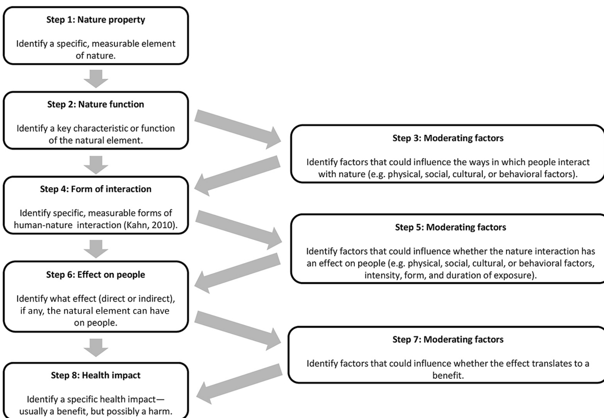
Figure 2. A proposed framework for studying the health benefits of nature contact (adapted from Shanahan et al. 2015b).

Fifth, standard exposure measures are not grounded in the ecological elements most relevant to human health and well-being. What is it about a walk in the forest that confers benefits? Is it the vegetation type (Wheeler et al. 2015)? The level of biodiversity (Dallimer et al. 2012; Lovell et al. 2014; Rook 2013)? Does it matter if the trees are in leaf, or is a wintertime walk equally effective? Is wildness required, or does an orderly tree farm or agricultural field suffice? Precisely which elements of exposure need to be measured?