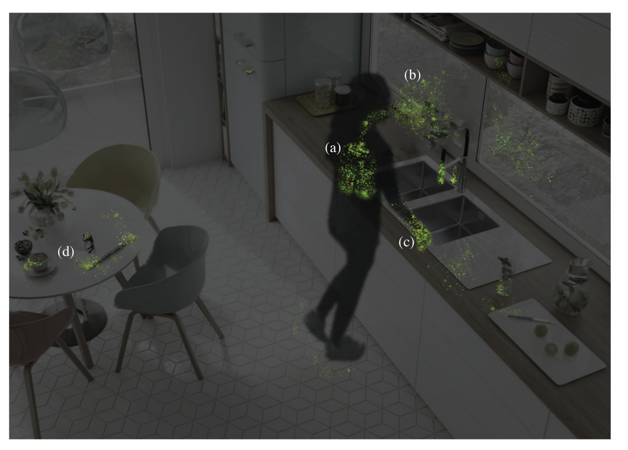
FIG 2 Conceptualization of SARS-CoV-2 deposition. (a) Once an individual has been infected with SARS-CoV-2, viral particles accumulate in the lungs and upper respiratory tract. (b) Droplets and aerosolized viral particles are expelled from the body through daily activities, such as coughing, sneezing, and talking, and nonroutine events such as vomiting, and can spread to nearby surroundings and individuals (34, 40). (c and d) Viral particles, excreted from the mouth and nose, are often found on the hands (c) and can be spread to commonly touched items (d) such as computers, glasses, faucets, and countertops. There are currently no confirmed cases of fomite-to-human transmission, but viral particles have been found on abiotic BE (built environment) surfaces (34, 39, 42).